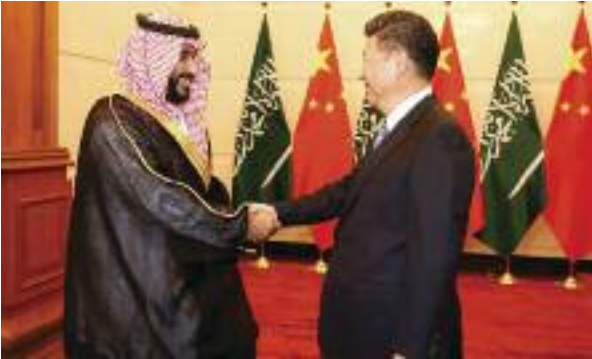
Saudi Crown Prince Mohammed bin Salman (L) with Chinese President Xi Jinping.

Israel has privately expressed concerns to the Trump administration about a new nuclear facility reportedly built in the Saudi desert with Chinese help, Israeli officials said.