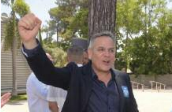
Meretz head Nitzan Horowitz