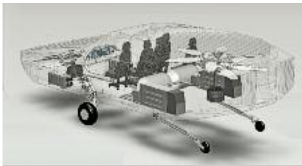
Drawing of the inside of the CityHawk VTOL