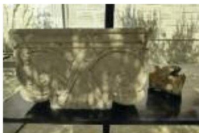
The symbol of the Davidic dynasty

A “once in a lifetime” find is how the City of David described three immaculately preserved 2,700-year-old decorated column heads, or capitals, from the First Temple period that indicate a connection to the Davidic Dynasty.