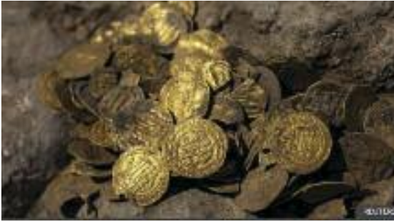
The coins buried in the jar are 24-carat gold and weigh 845g (30oz)