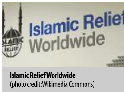
Islamic Relief Worldwide

The entire leadership of Britain's biggest Muslim charity has resigned after it emerged that it had replaced a trustee who had stepped down over antisemitic posts with a man who glorified terror attacks against Israel, and described the Jewish state as the "Zionist enemy."