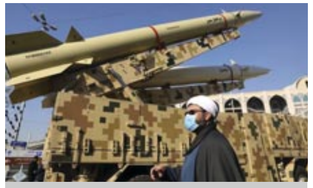
A cleric walks past Zolfaghar, top, and Dezful missiles displayed by the paramilitary Revolutionary Guard, at Imam Khomeini grand mosque, in Tehran, Iran

Between Iran's nuclear ambitions, funding of terror groups such as Hamas and Hezbollah, growing military presence in Syria, and attempts to target Jewish communities and Israeli diplomatic staff in the Diaspora, it's no wonder that many Israelis today view the Islamic Republic as a mortal enemy.