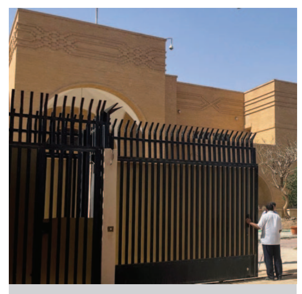
People stand outside the Iranian embassy in Riyadh, Saudi Arabia.

Iran's embassy in Saudi Arabia reopened its gates for the first time in seven years, a Reuters witness said, under a deal to re-establish ties that could ease a long-standing rivalry that has helped fuel conflicts around the Middle East.