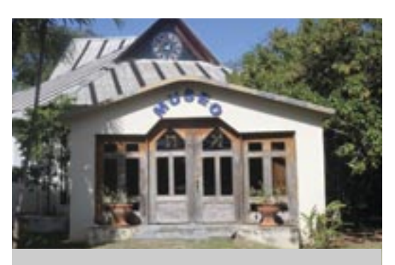
The Museo Judio de Sosua, which tells the story of the Jewish refugees who found a safe haven in the Dominican Republic during the Holocaust. The museum is closed while the community waits for funding to reopen it.

de Sosua. It was built in the early 1940s to meet the spiritual needs of about 750 German and Austrian Jews.