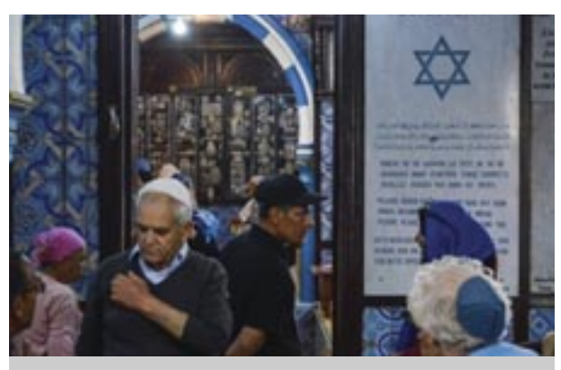
Jewish pilgrims at the Ghriba synagogue in Tunisia's southern resort island of Djerba

A gunman killed five people in an attack on an ancient synagogue in Tunisia, during an annual pilgrimage that attracts thousands of Jews and is seen as a rare instance of Jewish partnership with an Arab nation.