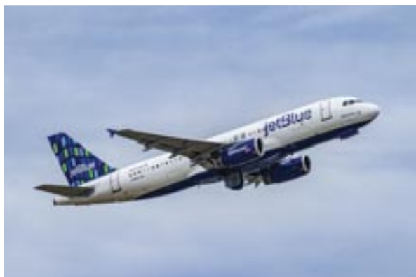
Photo of JetBlue in midair flight

American airline JetBlue Airways has updated their in-flight map to show the words "Palestinian Territory" in significantly larger text than the word "Israel," to the point where it is overlaid on the entire state of Israel, N12 reported.