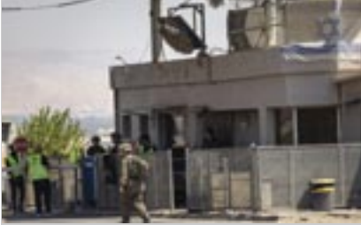
Israeli security forces near the scene where three civilians were murdered in a terror shooting attack at Allenby Bridge, a crossing between the West Bank and Jordan

The population of Jordan stands at 11+ million. Average life expectancy is 76.5 years, and the infant mortality rate is 13.2 deaths per thousand live births. Per capita GDP is $9,400.